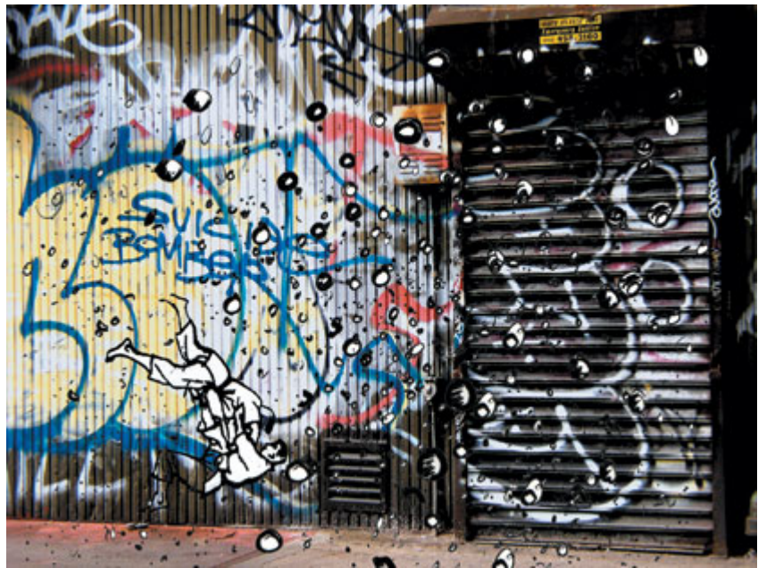
Print of Karate by Byron Flitsch, $50.